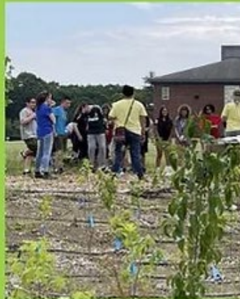
Ayer Shirely Regional Middle School Site: Behind the School @ 1 Hospital Road, Shirley