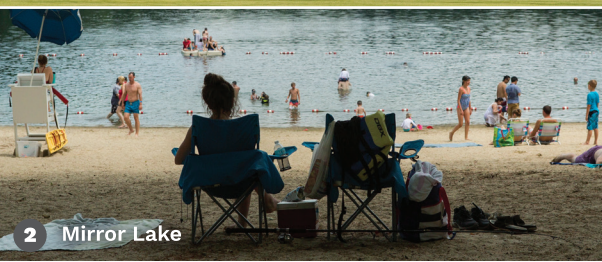
2 Mirror Lake