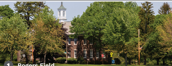
1 Rogers Field

Enjoy easy access to Route 2, Route 2A, and Interstate 495 connecting you to everything Massachusetts has to offer. Local shuttle service to the MBTA Commuter Rail provides employees an alternative to driving.