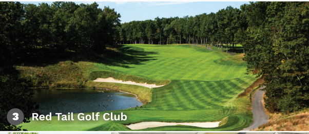
3 Red Tail Golf Club