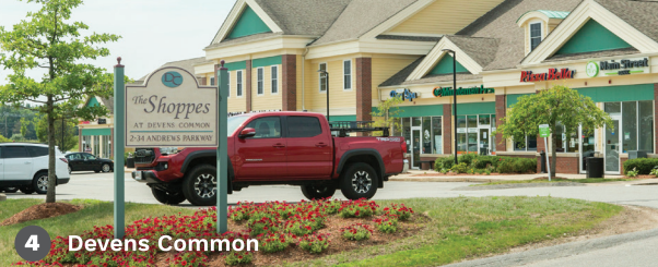
4 Devens Common